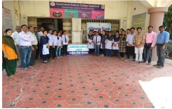
Preamble of Constitution read by students and staff