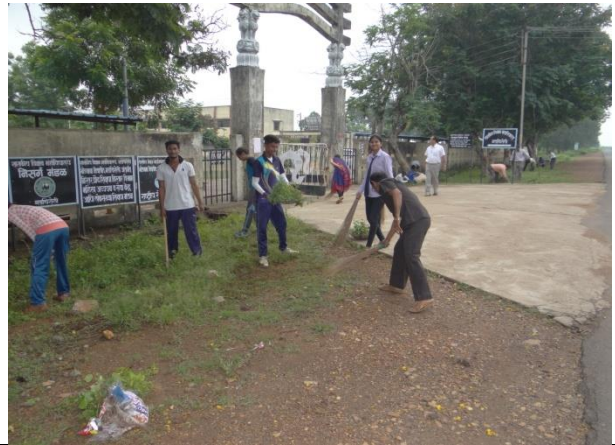
Swachata Din (Cleanliness drive) 2 nd October