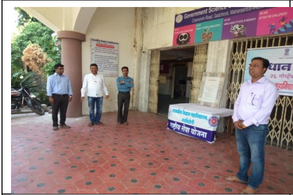
National constitution day on 26 th November