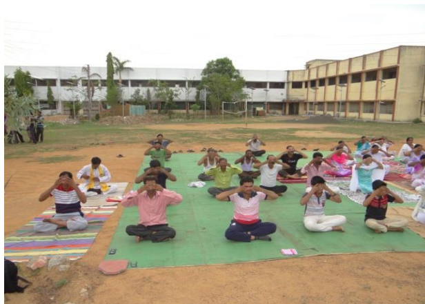
International Yoga day on 21 st June