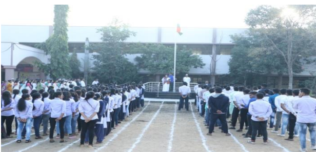
On the occasion of Republic Day- Mass reading of preamble of “The constitution of India”