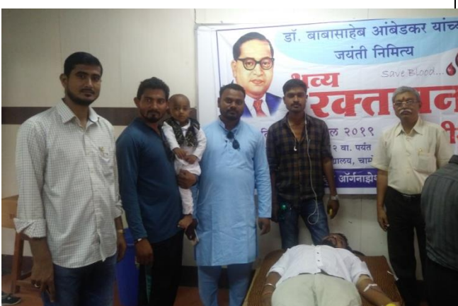
Blood donation camp on the eve of Ambedkar Jayanti