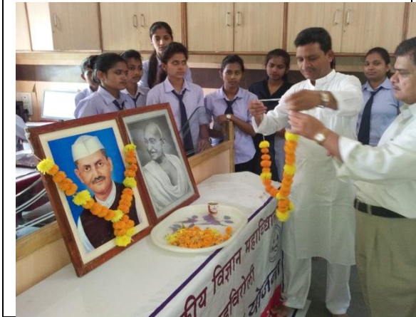
Mahatma Gandhi & Lal Bahadur Shastri Jayanti celebration on 2 nd October