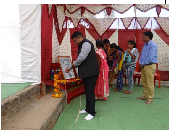
Ambedkar Jayanti celebration 14 th April