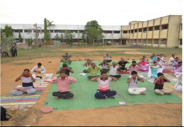
International Yoga day on 21st June