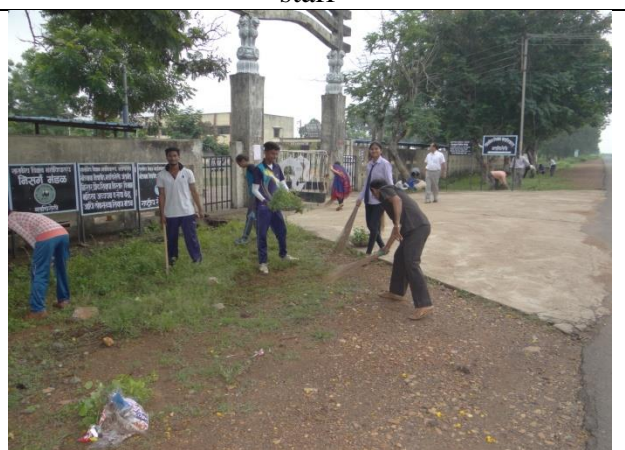
Swachata Din (Cleanliness drive) 2<sup>nd</sup> October