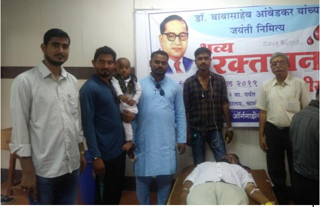
Blood donation camp on the eve of Ambedkar Jayanti