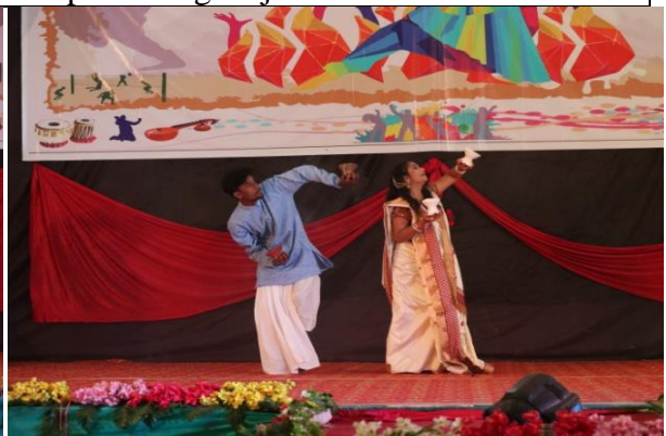
“Dhunuchi” a traditional dance showing the uniqueness of West Bengal