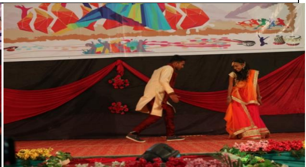
Playing Dandia and Garba students representing Gujarati culture