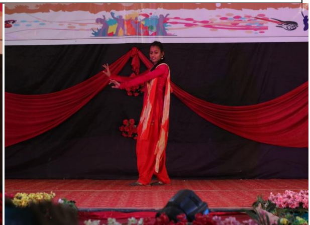
"Giddha" a famous folk dance of Punjab displaying feminine grace and elegance