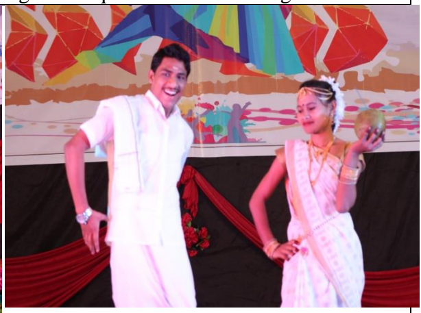
Students take delight in traditional dress of kerala