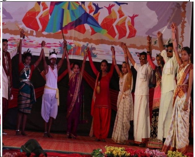
A group photograph showing "Unity in Diversity"