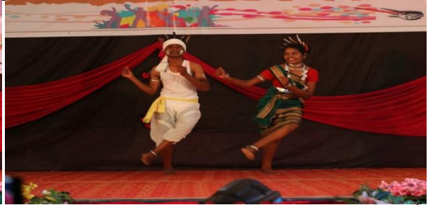
Students representing tribal culture with “Rela” dance