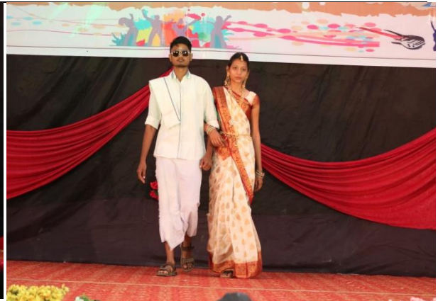
Students representing Tamil attire