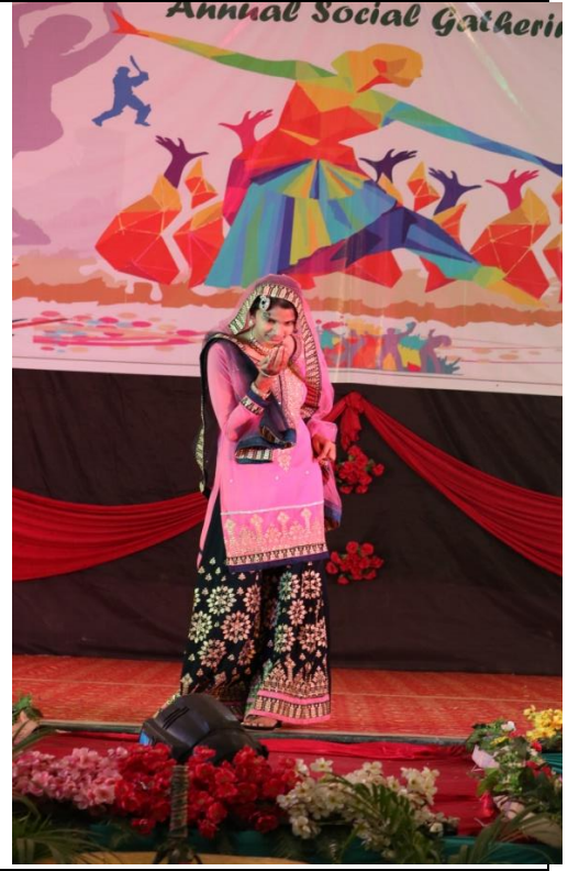
Student representing Muslim culture