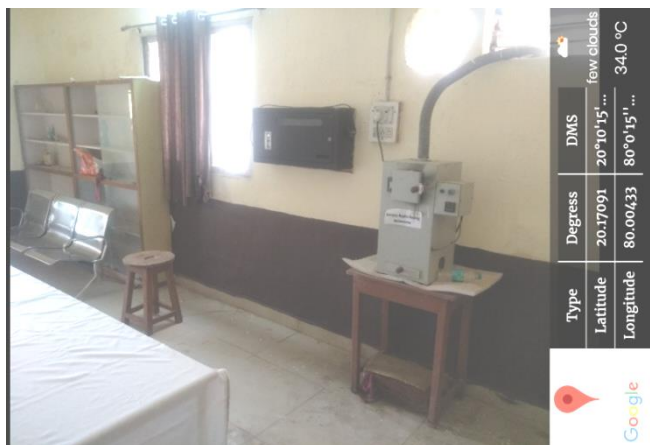
Sanitary napkin Vending and Incineration machine