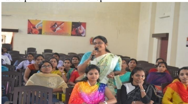
Participants asking the questions to resource persons in panel discussion