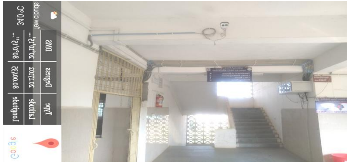
CCTV Camera installed inside the college