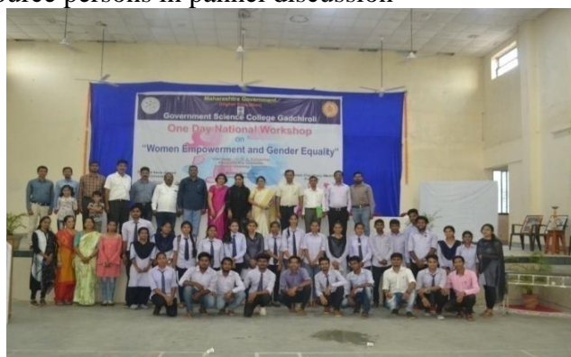
Group photograph- dignitaries and participants