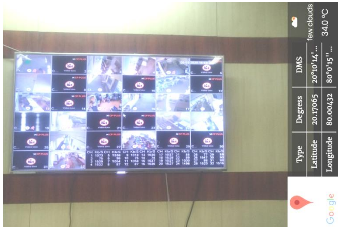
Central TV monitor placed in principals chamber