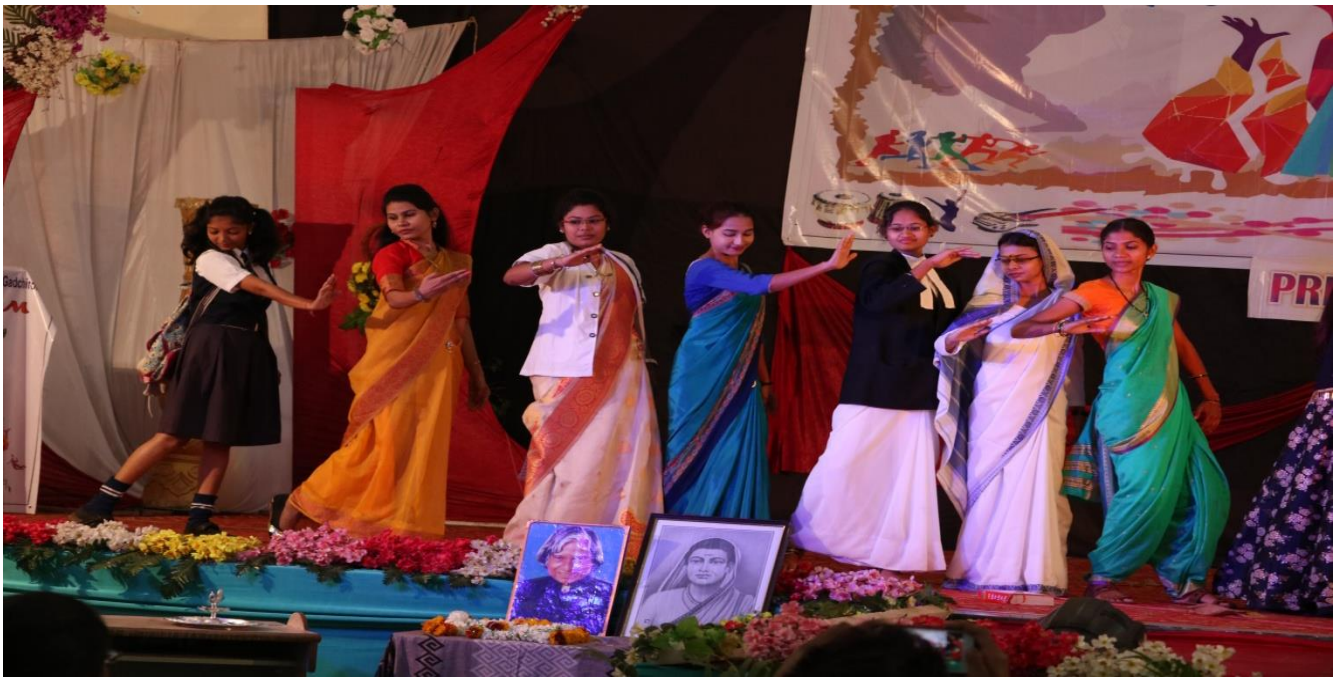
Women empowerment in a real sense