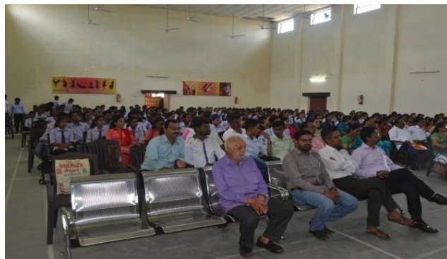
Participants in the workshop