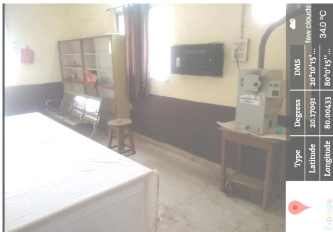
Girls common room (Internal view)