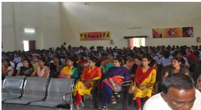
Participants in the workshop