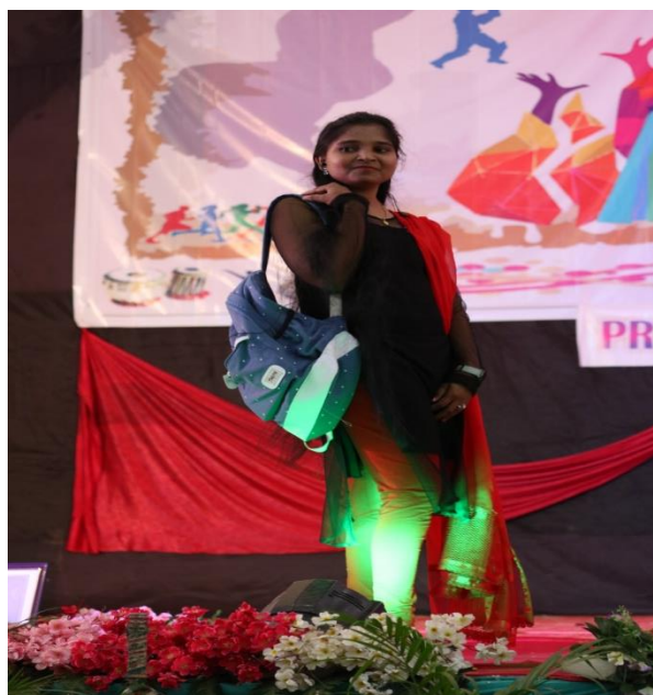
A college girl