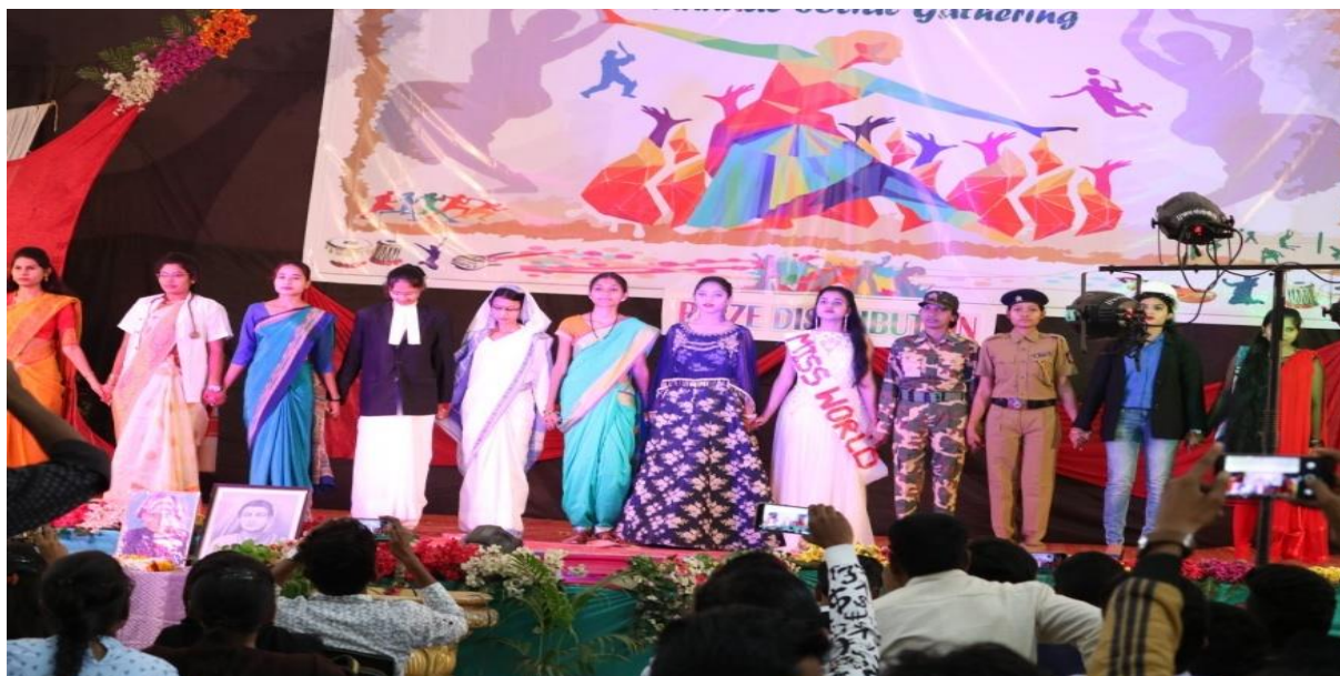
A Group photograph- showing the girl students representing the women in different field viz. A Teacher, Doctor, Air hostess, Advocate, Social worker, Housewife, Actress, Miss world, Army, Police, Engineer, College girl etc.

This show also developed a respect towards women in male students and made them to understand womens are equal to men.