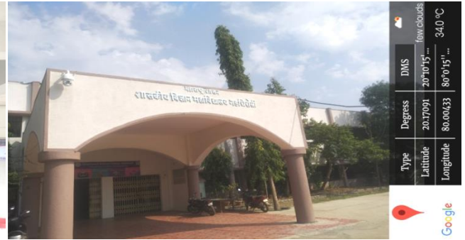
PTZ camera can rotate to keep eye on activities taking place in the campus