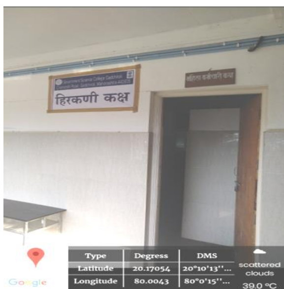
“Hirkani Kakshya” a room for feeding the infants.